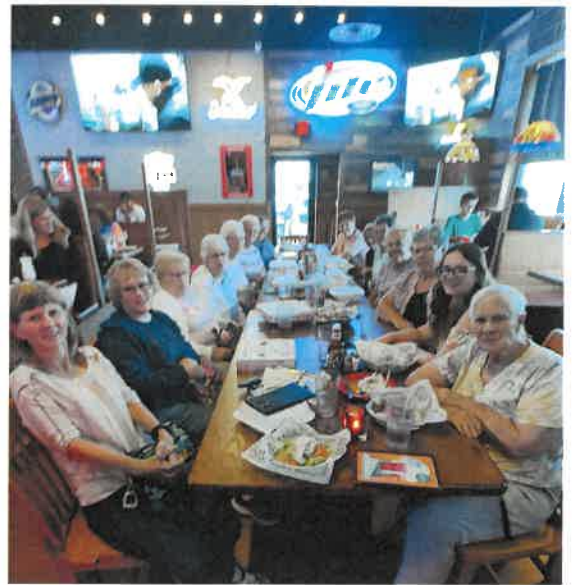
Fourteen women enjoyed a fun night out in July.